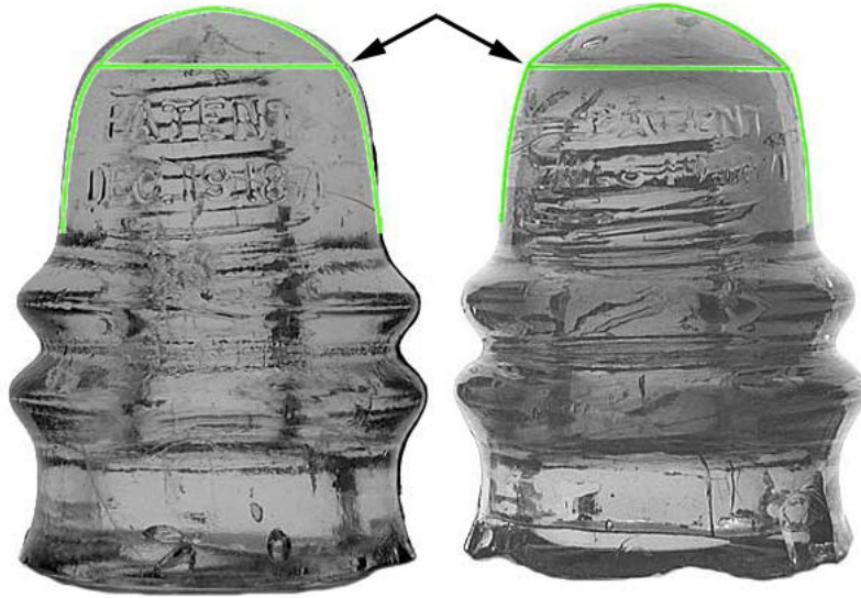
Figure 5: (left) Smooth crown-to-dome transition (right) Angular crown-to-dome transition