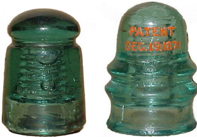
Figure 1. Photographs of CD 127.4 and CD 131.4 insulators.

A mystery has long existed within the insulator hobby about whether or not certain unembossed threaded glass insulators, identified by “Consolidated Design” Numbers 1 (CD) 127.4 and 131.4, might have been manufactured by the Hemingray Glass Company, Covington, Kentucky. Examples of these two insulator styles are shown in figure 1 .