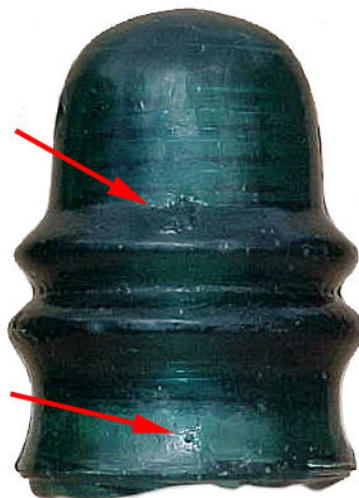
Figure 2. Unembossed CD 131.4 with matching mold marks

The insulators in each group were examined to determine if any physical feature would reveal that an unembossed mold could have been retooled to include the patent embossing. If this were found to be true, it would give credence to theories that certain unembossed and embossed insulators were produced by the same glass company. No evidence of such a “cross over” mold was observed among the CD 127.4 groups. However, there was one unembossed CD 131.4 that showed the same surface features found in one of the embossed sets. This insulator had a small raised glass “dot” centered on one half of a skirt mold piece. It also possessed a mold defect (a chunk of metal had been broken away, or rusted out) just above the upper wire ring and approximately centered in the same mold piece as the raised “dot.” These exact features were also observed on embossed CD 131.4 pieces. It was interesting to note that only one of the fifteen unembossed CD 131.4 insulators possessed these features while they were observed on five of the twenty-two embossed pieces. This example is shown in Figure 2 .