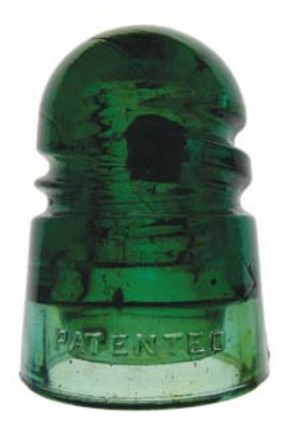
Still another is ROCKS

Even these pale in comparison with the BROOKIEs but that makes it all the more exciting when one is found and added to the collection.