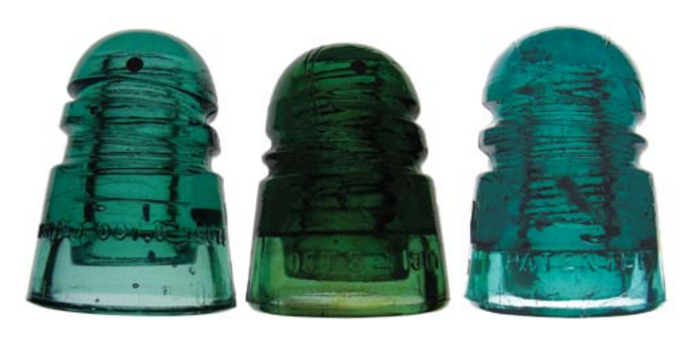
HEMINGRAY Typical aqua, BROOKFIELD Dark Green & BROOKFIELD true Blue