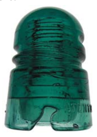
Was BROOKFIELD trying to save $$$ on glass?