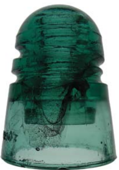
The most profuse amount of stuff (carbon) I've found in a HEMI 147. Picked myself.