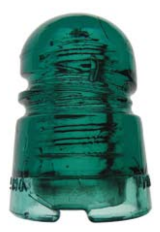
All I want for Christmas is my two front teeth!