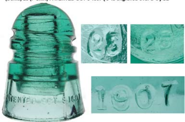
(Dome) 25 (F-Skirt) PATENTED OCT 8 1907 ('9' is engraved over a '0') SB

Another "NEW FIND" (also reported by Bill Meier) is shown above. It is now 8.5 on my list of variations. It has a 9 over 0 and no periods.