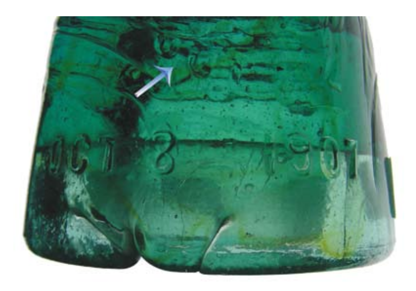
Somewhat subtle GHOST on an Under Pour piece

Actually, Ghost Letters / Numbers on insulators are another of my sub-specialties and a real favorite. I began this collection when I noticed them for the first time on more than one Spiral Groove. It turns out that it is not a real uncommon feature on these but most times it is quite subtle. Since the first several 147s I set aside because of this feature I have expanded the collection to include any CD. Below are pictures of just a few of the more prominent 147 examples.