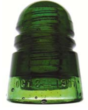
BROOKFIELDs -Teal Aqua & Toughest Color: Dark Yellow Green