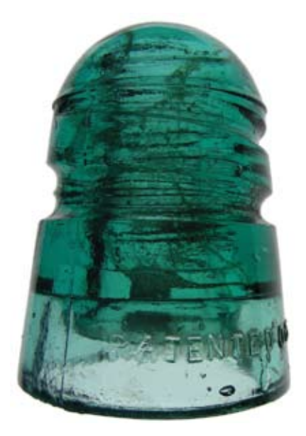
A waterfall of steamy bubbles

Even these pale in comparison with the BROOKIEs but that makes it all the more exciting when one is found and added to the collection.