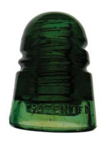
More BROOKFIELD Greens & 2 shape variations. Which is Front?