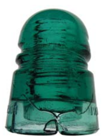
A hole in one. Anyone for golf?

All together these pieces make a pretty impressive display. I hope you enjoy viewing them as much as I do.