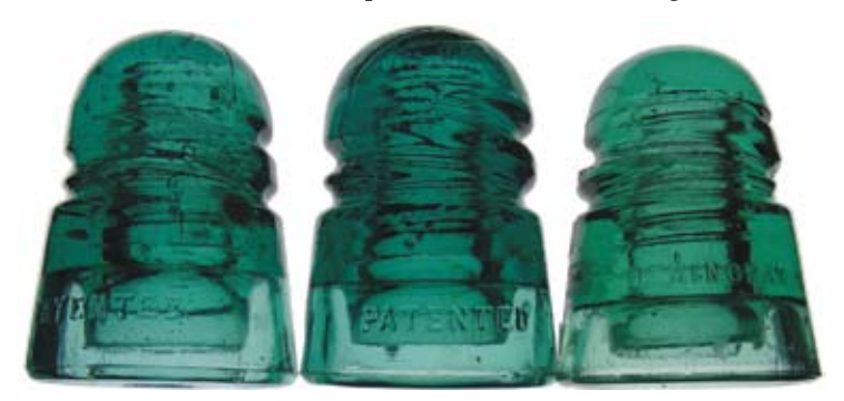
Typical BROOKFIELD, Straight BROOKIE, typical HEMINGRAY

While the CD 147 generally has a familiar "Bee Hive" shape, the Spiral Groove sets it apart from others with similar shapes, such as the CD143 and CD 145. Upon examination of numerous examples set in close proximity to one another one realizes that there are differences in profiles that are interesting.