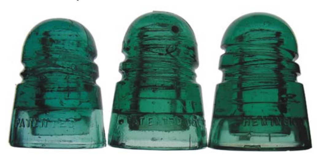
Typical BROOKFIELD, HEMINGRAY Type #5, typical HEMI Note the BROOKFIELD like rounded features, height and the color of the middle HEMI #5s while retaining the HEMINGRAY style taper.

down look (some style # 13 and all style #s 14 & 15) (see chart above) while others are much more angled. My measurements show the BROOKFIELD diameter differences range from .500" for the STRAIGHT style to .643" for the TYPICAL style. That doesn't sound like a lot but it is visually apparent as seen above. The measurements were taken at the widest part of the skirt and at the mold seam around the crown, just above the top of the Spiral groove. All of the HEMINGRAY 147s are about the same except for an oddball example which looks almost like BROOKFIELD pieces.